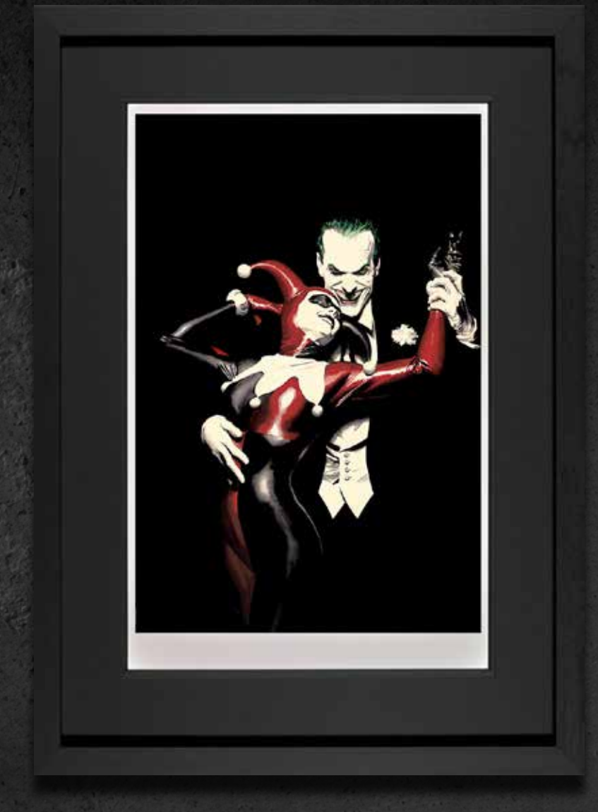
TANGO WITH EVIL Paper Edition, Size: 17 x 26", Edition Size: 195 £595

Emerging from a sea of black are the Clown Prince and his faithful partner in crime, Harley Quinn. The eerie couple is bound together by their enigmatic relationship and their utter disdain for Batman.